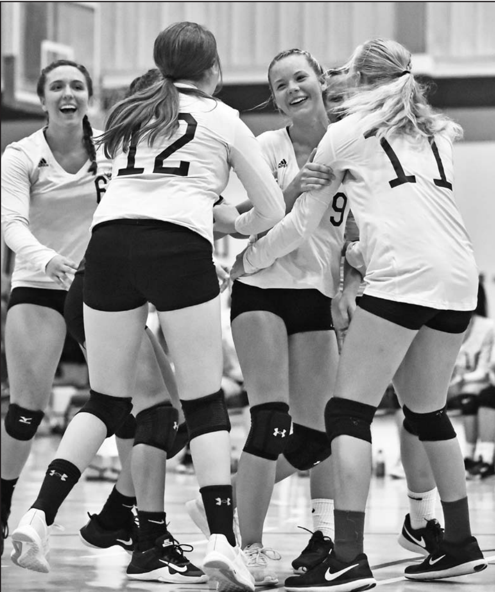
Union County celebrates a point during its comeback bid vs Pickens on Thursday.